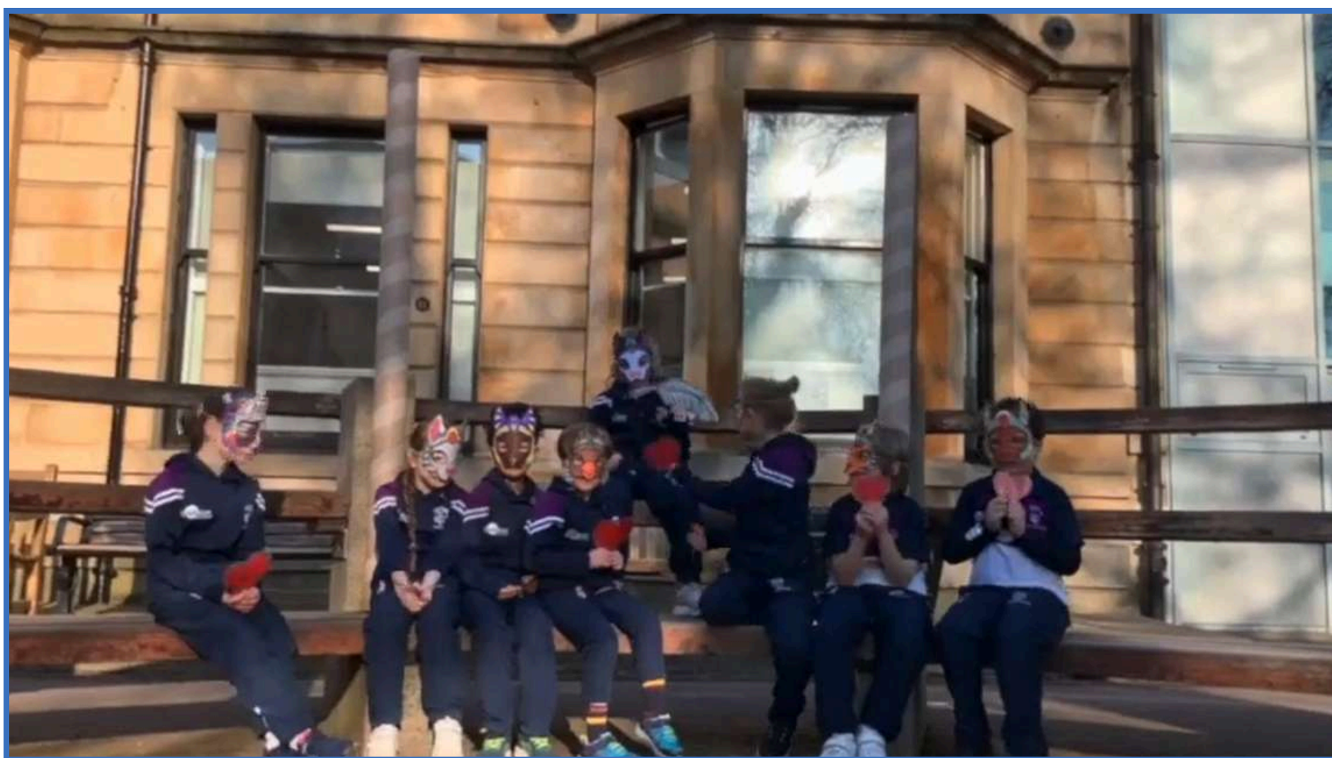
Music video by Glasgow Academy Primary School